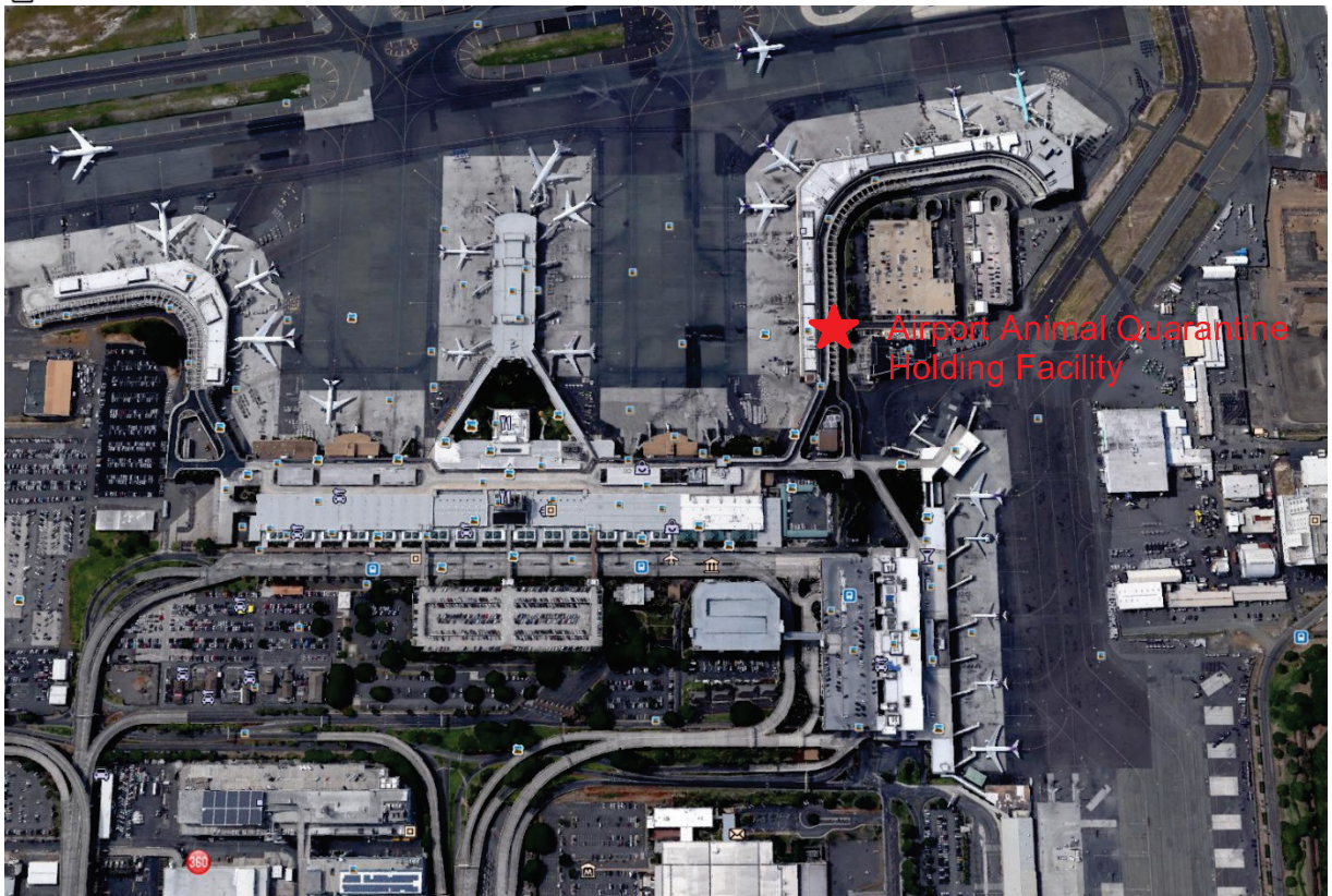
Photo of the Daniel K. Inouye International Airport in Honolulu (HNL)